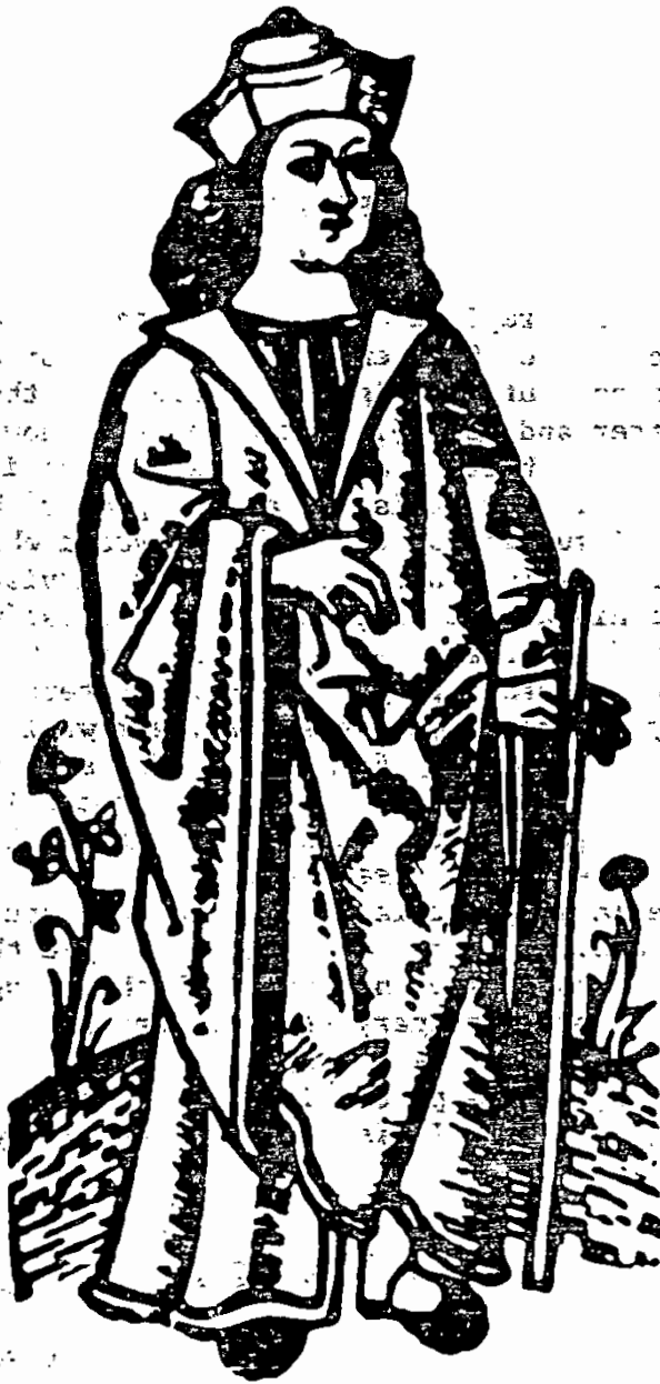
FERNANDO DE ROJAS Grabado de la Edición de Valencia, 1518 (M)