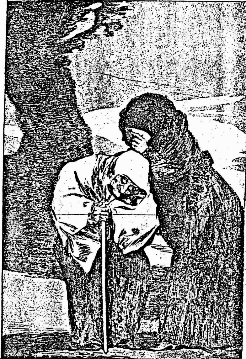
Treatment of a celestinesque theme by