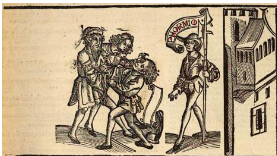
Fig. 18 Terentius cum Directorio , Glosa interlineali, Comentariis , Strasbourg, Johann Grüninger, 1496, f. q4r.