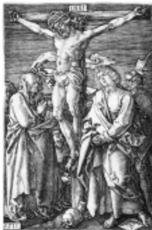
Fig. 6 The Crucifixion , Albrecht Dürer (1511).