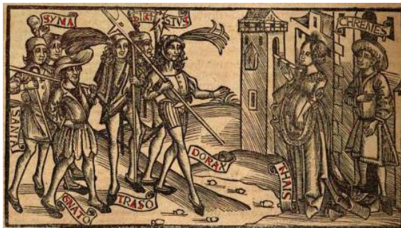
Fig. 17 Terentius cum Directorio , Glosa interlineali, Comentariis , Strasbourg, Johann Grüninger, 1496, f. i3v.

trayed in detail. By virtue of their violence, they qualify as true imagines agentes . However, the depiction of violence is not what interests us the most, but the pointing finger of the character with a hat and a rod, probably the sheriff. To start with, this is not a gesture present in any of the woodcuts portraying armed men in Johann Grüninger's illustrated edition of Terence. Although the group of soldiers in the xylography at the beginning of scene xvi in Grüninger's Eunuchus resembles the armed men in Celestina , the free hand of the figure identified as Dorax (see Fig. 17) seems to be saluting, not pointing. Exactly the same can be said about the factotum block (Fig. 18) representing a man, identified as Phormio, with a halberd and a hat that resembles the one worn by the sheriff in Celestina . Despite the striking similarities, Phormio's free hand is clearly not pointing. The conclusion is that, since Grüninger's figures do not include the pointing finger, adding it must have had a special significance for the engravers, beyond that of mere artistic license.