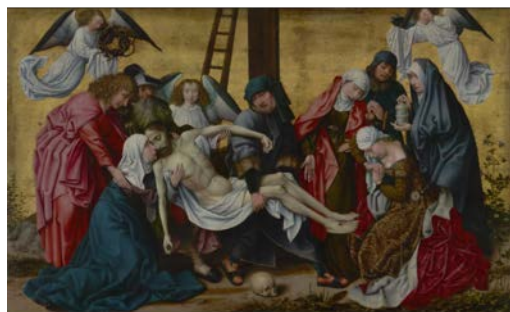
Fig. 4 Deposition , Follower of Rogier van der Weyden (ca. 1490).

Moreover, the ladder, despite being part of the plot in Celestina , is also an iconic —and instrumental— element of the Descent from the Cross that usually appears in the background, exactly as in Celestina . This coincidence reinforces the relationship between the illustration of the fall and death of Calisto and the iconography of the Passion.