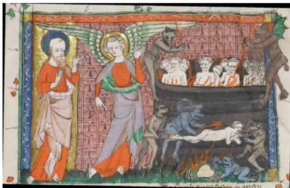
Fig. 19 Visio Sancti Pauli , CCCC Ms 20, Parker Library, f. 66r. Image by University of Stanford (original at Corpus Christi College).

The representations of Hell and Purgatory also present pointing fingers in visually violent contexts similar to the deaths of Celestina and of the servants (see Fig. 19). There, the pointing finger acts as an invitation—or an exhortation—to contemplate the suffering of the souls of the condemned and the penitents. The call to attention of the pointing finger enhances the efficiency of the imagines agentes in raising fear in the hearts of the believers. This convention of religious imagery provides a pictorial scheme in which a static character, situated at the margin of the scene, points with his or her finger to an active image — imago agens — that portrays punishment as a negative example. In our opinion, these religious images are the point of reference for the engravers in designing the woodcuts illustrating the deaths of Celestina , Sempronio, and Pármeno. This impression is reinforced by how all the characters are staring at the death scenes, which contributes to focusing the readers' attention on the tragic fate of the characters. Contemporary readers would automatically interpret the above-mentioned pointing as an invitation to meditate, that is, to become emotionally engaged in the scene. In addition, the connection with the religious imagery of Purgatory and Hell would contribute to defining the deaths of the servants and the go-between as punishment for their sins, thus reinforcing the didactic and moral message of Celestina .