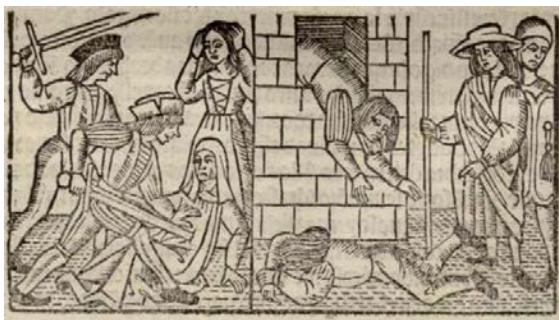
Fig. 16 Libro de Calixto y Melibea y de la puta vieja Celestina, Sevilla, Jacobo Cromberger, 1502 (but 1518-1520), act XII, f. f6v.

The woodcuts representing the murder of Celestina and the execution of Pármeno and Sempronio have in common that they depict the violent climax of their respective actions. The moments of choice are the most pathetic actions —stabbing, falling, and beheading— which are por-