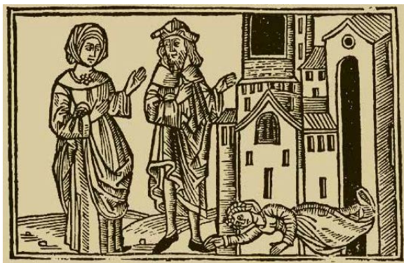
Fig. 2 Fall of Melibea in Comedia de Calisto y Melibea, Burgos, Fadrique de Basilea, 1499 (but 1500-1502), act xiv, f. 18r.