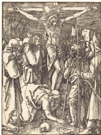
Fig. 8. The Crucifixion, Albrecht Dürer (ca. 1509-1510).

Furthermore, Pleberio adopts a posture that recalls that of Saint John in the tradition of the Passion, either quietly holding his hands, as in the 1523 Sevilla (but Venice) and the Valencia 1514 editions (Fig. 5 & 7), or raising his arms, as in the editions with the fake 1502 colophon (Fig. 9), in a much more distressed gesture, related to mourning.