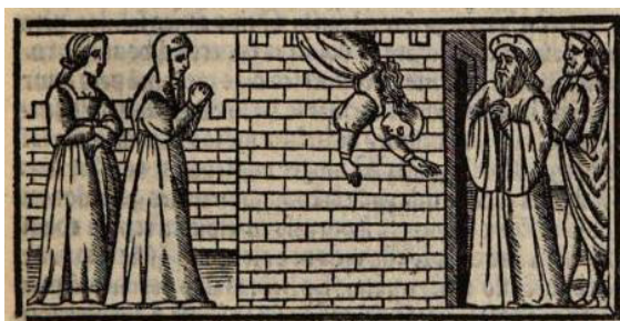
Fig. 7 Suicide of Melibea in Tragicomedia de Calisto y Melibea , Sevilla (but Venice), Juan Bautista Pedrezano, 1523, act XXI, f. M3r.

This similarity is reinforced by how the female character at the foot of the tower —be it Alisa or Lucrecia— holds her hands as if in prayer, a gesture commonly assumed by the Virgin Mary in many depictions of the Crucifixion (Figs. 8 and 10). We can even speculate if the inclusion of Melibea's mother, Alisa, in the woodcut of the Valencia 1514 edition is the result of the engraver having the model of the Crucifixion in mind. He would have felt urged to include the mother in the block, despite the text being absolutely clear about her not being present in the scene. 10 Something similar could be said about the presence of two extra characters, one female and one male, in the corresponding xylography of the 1523 Venetian edition by Juan Bautista Pedrezano: this would be an attempt to reproduce the presence of several characters at both sides of the Cross, frequently distributed by sex, in the cycle of the Passion of Christ (see Figs. 7 and 8).