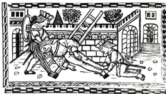
Fig. 3 Dead Calisto carried away by his servants in Tragicomedia de Calisto y Melibea , Valencia, Juan Joffre, 1514, act XIX, f. H8r.

the ankles by his servants. This posture is typically associated with the Descent and the Deposition and it is not to be exclusively attributed to textual faithfulness (see Figs. 3 and 4). 9