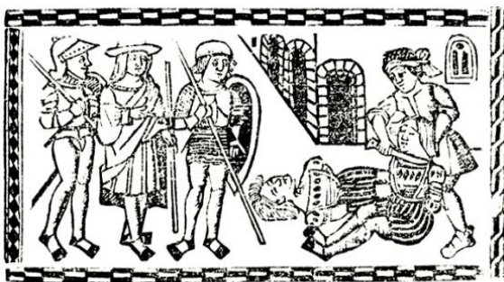
Fig. 12 Tragicomedia de Calisto y Melibea , Valencia, Juan Joffre, 1514, act XIII, f. G3r.

Despite minor differences, the woodcuts depicting the deaths of Sempronio and Pármeno in the different illustrated editions share the same scheme: under the attentive eyes of a curious audience, one of them has already been executed. His head is presented as either attached to the body (Valencia 1514, Fig. 12), or in the hands of the assistant to the executioner (editions with the fake 1502 colophon, Fig. 14). Meanwhile, the executioner, either holding his sword up in the air (editions with the fake 1502 colophon, Fig. 13) or against the neck of his victim (Valencia 1514, Fig. 12), is about to behead his second victim.