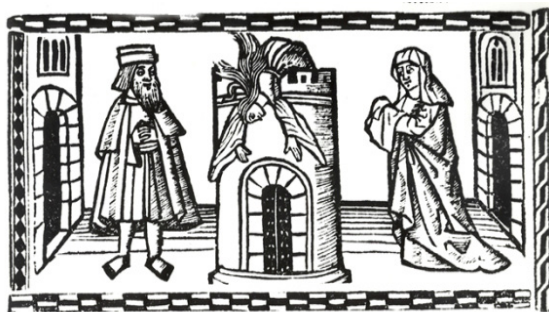
Fig. 5 Suicide of Melibea, Tragicomedia de Calisto y Melibea , Valencia, Juan Joffre, 1514, act XXI, f. I3r. Image by Banco de recursos ATENEX (original at the Biblioteca Nacional de España).

The woodcuts illustrating the death of Melibea undergo a similar evolution. In the Comedia , Melibea is equally portrayed as a victim of the Wheel of Fortune on the verge of hitting the ground. However, attention shifts to her jumping off the tower in the Tragicomedia : Melibea appears in the middle of the upper half of the illustration, in the act of taking the fatal jump. In the Valencia 1514 edition, her parents stand at the foot of the tower, one at each side, looking at her (in the editions with the fake 1502 colophon, her father and her servant Lucrecia are the ones standing at the foot of the tower, which is a true representation of the words of the text). The male and female figures at the feet of the instrument of death recall the Crucifixion, with the Virgin and Saint John to the right and to the left of the Cross, and Christ above them, in the middle (see Figs. 5 and 6).