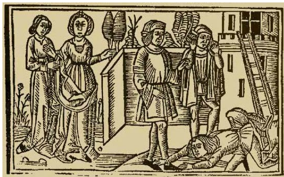
Fig. 1 Fall of Calisto in Comedia de Calisto y Melibea, Burgos, Fadrique de Basilea, 1499 (but 1500-1502), act xiv, f. l2r.

In Celestina five characters die: Celestina, Sempronio, Pármeno, Calisto, and Melibea. Curiously enough, in the iconographical tradition of the work, the death scenes are the only ones that escape the static scheme of Johann Grüninger's illustrated editions of Terence—considered one of the sources for the illustration of the Burgos 1499 Comedia —and receive a more dynamic (= agens ) treatment. 8 Even in the Burgos Comedia , in which the debt to the German factotum blocks is most evident, the woodcuts devoted respectively to the deaths of Calisto and Melibea move away from the predominant vertical scheme imposed by the shape of narrow printing blocks. These two woodcuts represent Calisto and Melibea in a horizontal design, in the act of falling, overlapping the width of two factotum blocks (see Figs. 1 and 2).