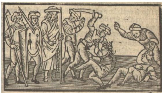
Fig. 13 Tragicomedia de Calisto y Melibea , Sevilla, Jacobo Cromberger, 1502 (but 1511), act XIII, f. Q1r.