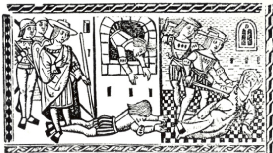
Fig. 15 Tragicomedia de Calisto y Melibea , Valencia, Juan Joffre, 1514, act XII, f. G2v.

a major change: Elicia is not included, despite her being described at the murder scene in the text. 20 This omission seems to be an artistic license by the engraver, who is most interested in showing the window in the background. Three protruding wood or stone blocks under the window are an important detail that connects the interior window with the same window depicted in the other half of the scene, from which Sempronio and Pármeno jump, that also has three black blocks below.