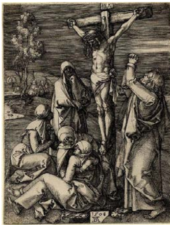
Fig. 10 The Crucifixion, Albrecht Dürer (1508).

Finally, although this point is not so evident, Melibea holding her arms open while she falls echoes Christ on the Cross, and Lucrecia's long hair in the woodcuts of the editions with the fake 1502 colophon can be related to the presence of Mary Magdalene at the Crucifixion, who is generally portrayed with long, loose hair—notice that this is the only woodcut in which Lucrecia is portrayed with this hairstyle. 11