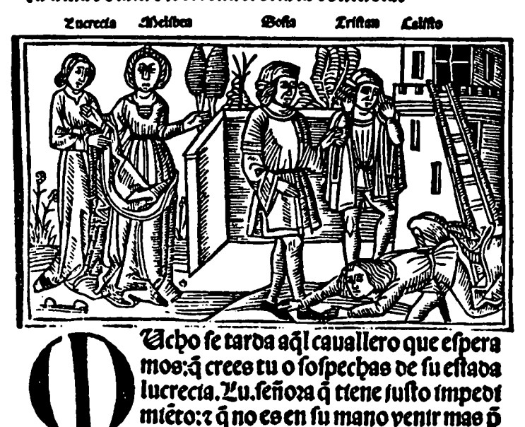
Figure 6. Death of Calisto and Iamentation scene. Comedia de Calisto y Melibea , Burgos, Fadrique de Basilea, 1499?, New York, The Hispanic Society of America, sig. LIIv, as reproduced in facsimile (New York, 1970).

fe lucrecia. queda los dos folos. acabado fu negocio dere falir calisto: el qual por la escuridad dela noche erro la escala. caez muere. melibea por las vozes e la mientos de sus criados sabe la desastrada muerte de su amado. amostesce. lucrecia la consuela.